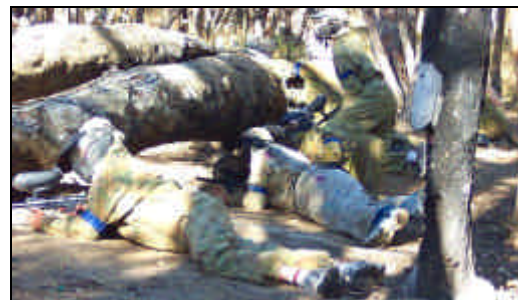
The PHS Testing Unit... "Here comes some suspect code. Get ready. Nothing gets through!"

For our company event this quarter, we headed down to Kuitpo Forrest where we took out our frustrations on each other.