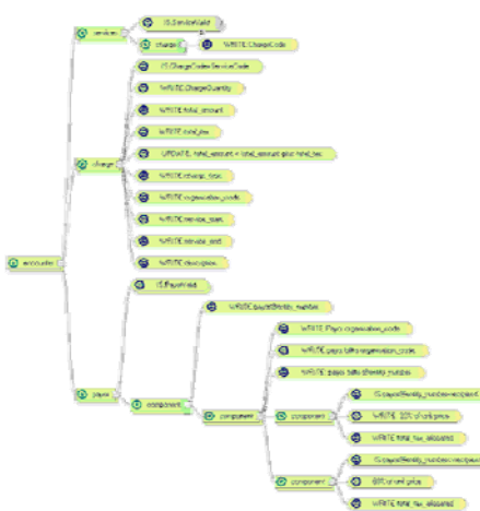
Sample IDIOM Decision Model